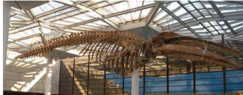
Fin whale stranded at Osaka Bay (19m in length)